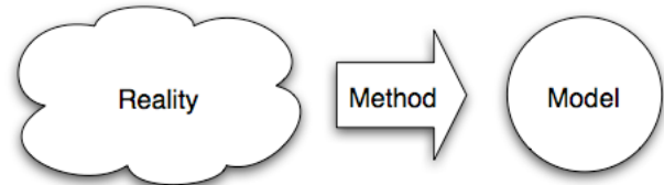
Figure 1: scientific process

Besides the workshop title, the description also states that the workshop will focus on design methodology and that it will "make a contribution to the establishment of design as a science." While the definition of a design science is a noble goal, the method chosen appears flawed. Science consists of a method to observe and abstract reality into models that are then used to explain and predict reality (see Figure 1). Newton's law of gravity, for example, explains why an apple hit Isaac Newton and it also helps us to predict the position of the planets in the future. The various sciences claim certain parts of reality as their phenomena under investigation.