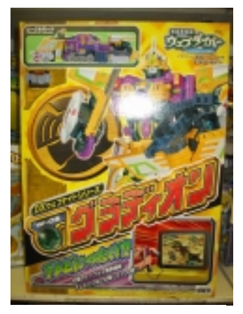
Figure 15: Gladion