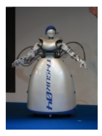
Figure 11: TMSUK IV