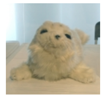
Figure 5: Seal