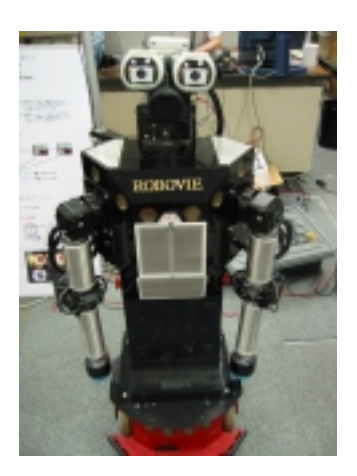
Figure 13: Robovie