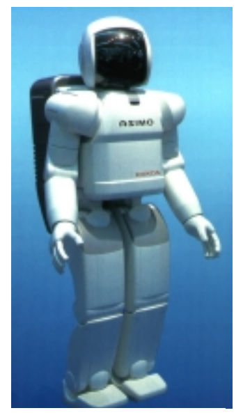
Figure 9: Asimo