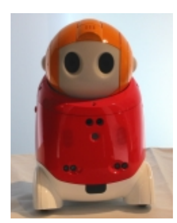
Figure 19: R100