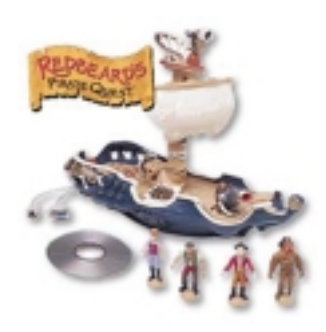
Figure 14: Zowie