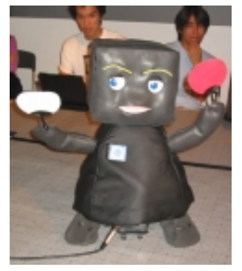
Figure 17: QB