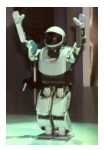
Figure 10: SDR-3X