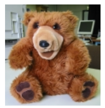
Figure 16: Sensor Doll