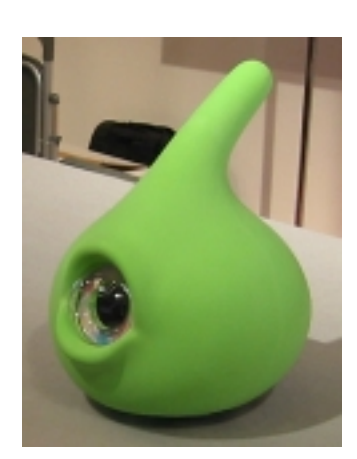
Figure 21: Muu2