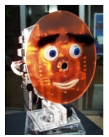
Figure 18: Pong

ship, such as the captain, are of course highly anthropomorphic, but only the whole ship with all of its part can be considered the RUI. Therefore it is also very difficult to apply the anthropomorphic scale.