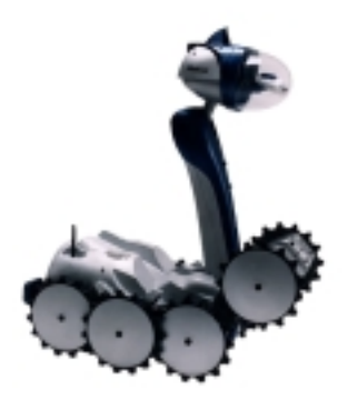
Figure 8: iRobot-LE