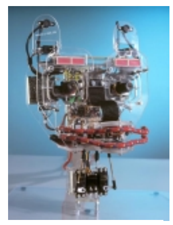
Figure 6: Mexi