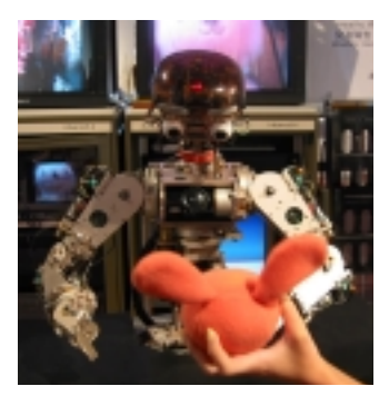
Figure 4: Infanoid