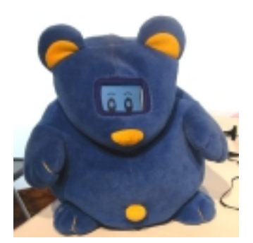
Figure 2: Kuma