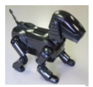
Figure 12: Aibo