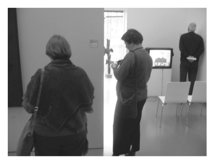
Figure 2. Visitors using ubiNext in the museum.

From the remaining 187 people 71 participants used the PDA individually while 116 used them in couples. The data recorded for the couples were treated as being one participant which results in