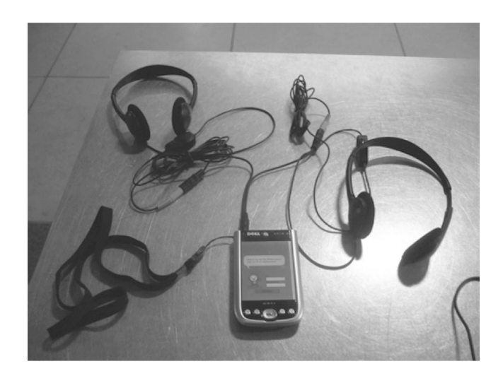
Figure 1. The Dell Axim C51v with two headsets.

They were offered a free ubiNext tour, and after making a deposit they would be given a PDA. If they had planned a tour prior to their arrival at the museum, they could login the system with their existing user ID and password. If they did not plan their own tour, then they would receive a login and password at the information desk. After a short introduction given by the staff, they entered the museum and could experience the museum with the ubiNext system as long as they desired (see Figure 2).