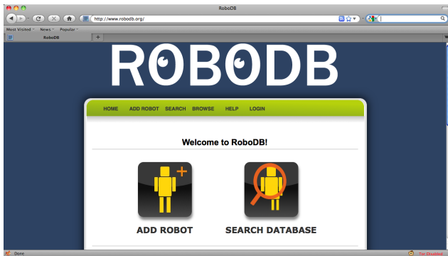
Figure 2: Graphical user interface of the RoboDB website.

Protégé [8] is an application used to model and build knowledge bases. It is considered a state of the art tool in semantic modeling and provides extensive set of features. However, Protégé requires a considerable learning effort to use it efficiently. Furthermore, despite providing a series of web plug-ins, Protégé still has to make its way on the web, as few web applications make use of it.